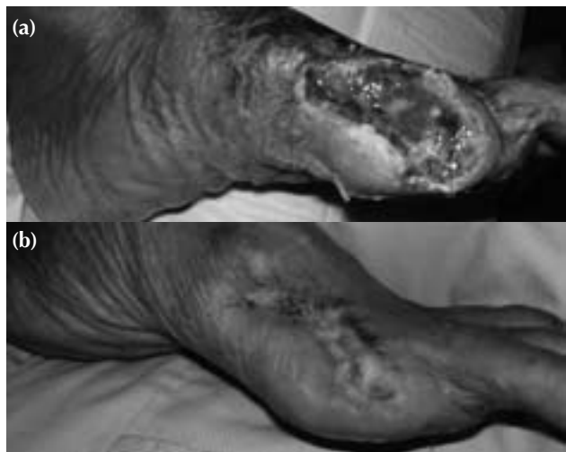
Figure 1 Patient 1: (a) grade-2 surgical ulcer measuring 5.5x3.5 cm, (b) completely healed ulcer at day 43.

wounds were covered with clear plastic (Tagaderm), and anodyne therapy system pads were placed over the plastic to prevent contamination, and on the lateral and medial aspects of the ipsilateral calf. Each therapy session lasted half an hour and was conducted 3 times a week (Monday, Wednesday, Friday) for patients at home or daily for patients in hospital, for one to 2 months. Wounds were cleaned and dressed after each session to minimise disturbances to the wound. No adverse symptoms or events were noted in any patients during therapy. Patients were assessed for peripheral neuropathies, pedal pulses, and wound size before and after therapy. Pictures were taken at each session to evaluate the effects of anodyne therapy on wound healing. Wound sizes and depths were graded according to the Wagner classification. 6