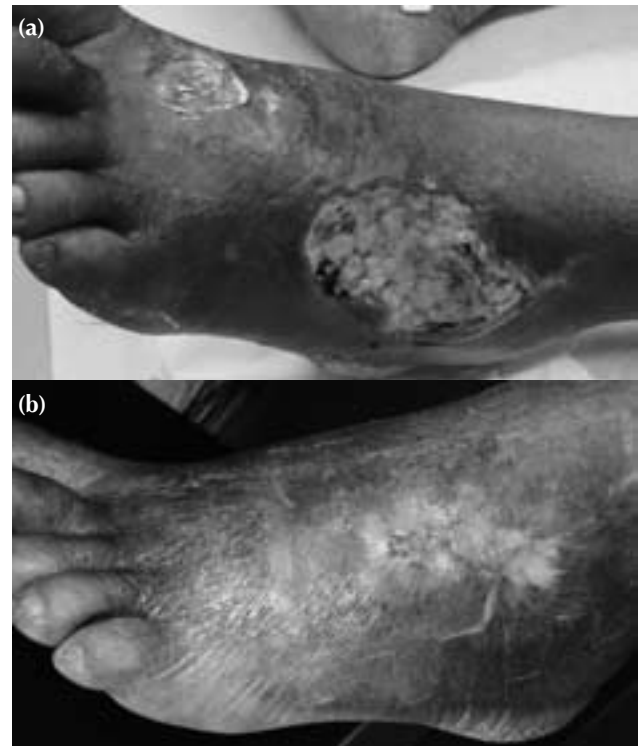
Figure 4 Patient 4: (a) grade-1 ulcers measuring 2.5x2 cm and 6x4.5 cm, (b) both ulcers healed completely at day 52.

NO is an endogenous vasodilator produced by endothelial NO synthetase during the oxidation of L-arginine to L-citrulline and NO. 3 Patients with diabetes often lack bioavailable NO due to reduced production of NO by NO synthetase and inactivation of NO by reactive oxygen species produced by glycated proteins or from vascular endothelium. 3,4 A small proportion of NO released into the vascular lumen is also transported in blood in the form of S-Nitrosothiol attached to haemoglobin. 4,7 In diabetic patients with elevated levels of glycated red blood cells, an increase in NO binding to red blood cells